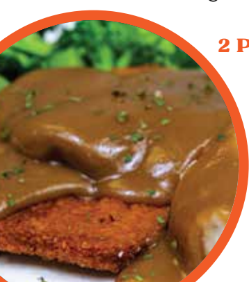
2 Pc Veal Cutlets

Two farmer's sausage, mashed potato & onions, topped with Bobs' famous gravy, served with side Chef Veg.