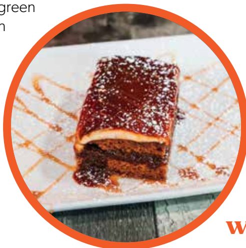
Warm Toffee Cake